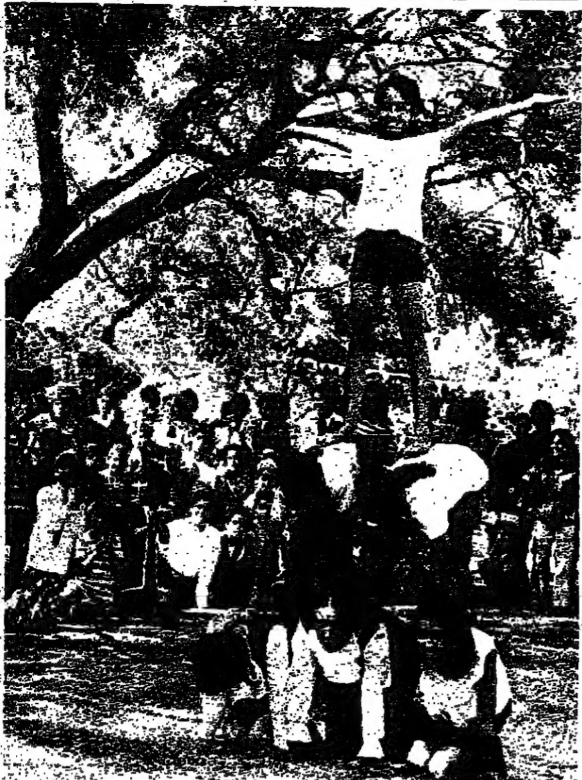
Gaza Strip campers at the Ashkelon day camp run by the Ministry of Social Welfare do exhibition gymnastics when the Director-General visited them last week.

GAZA — Gaza Strip girls are leaving home — if only for a week — to spend a day camp at the Ashkelon front and returning in the afternoon to spend the night under their parents' roof.